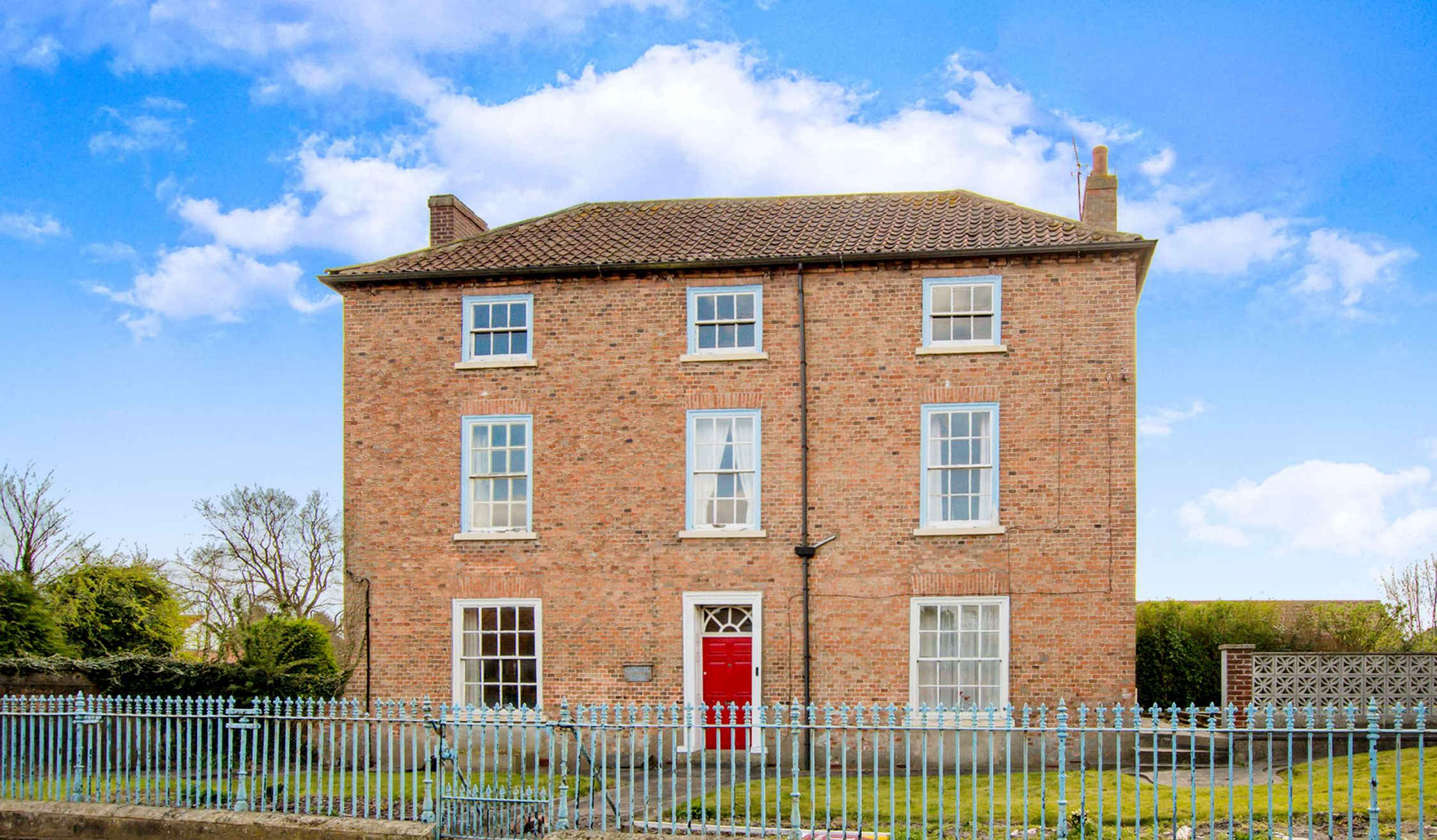
CUSHPOOL HOUSE, EAST MARKHAM £530,000