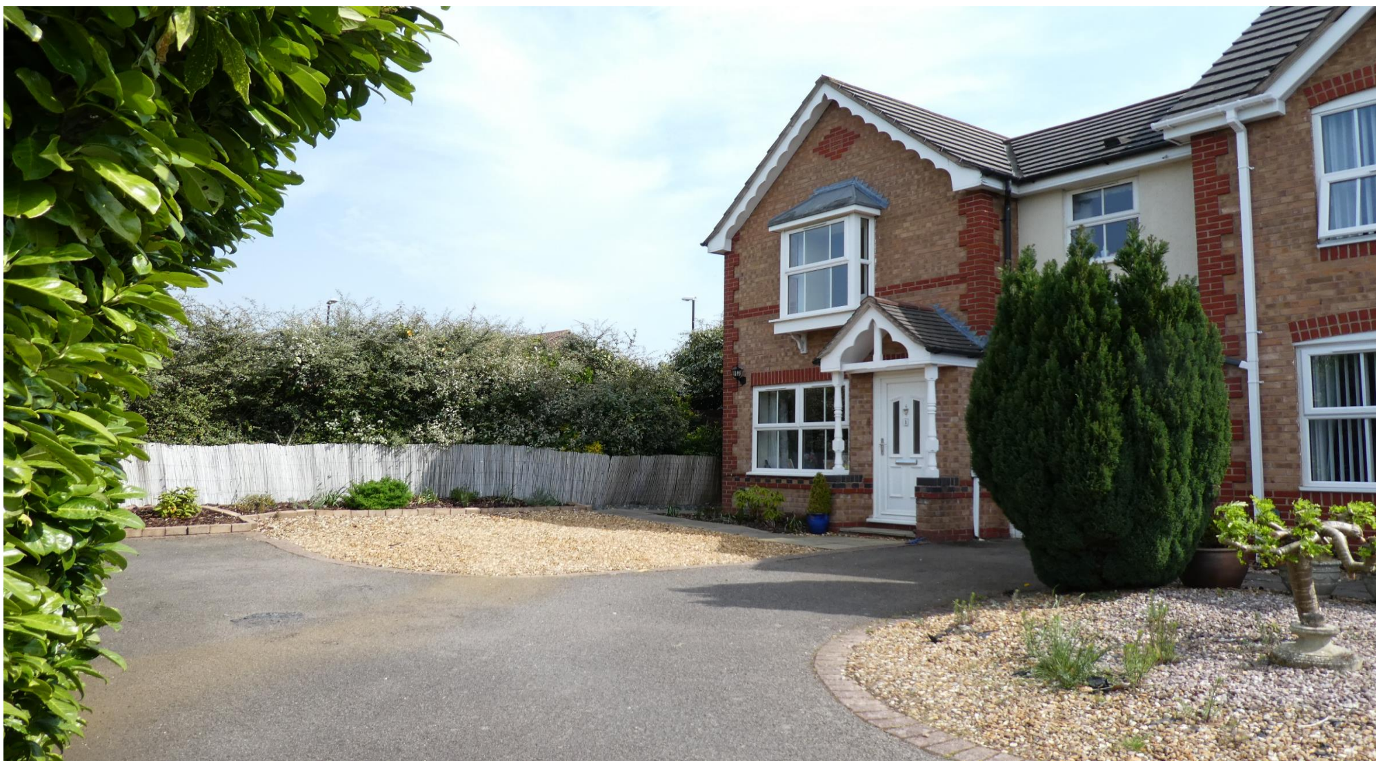
Butts Croft Close East Hunsbury, Northampton