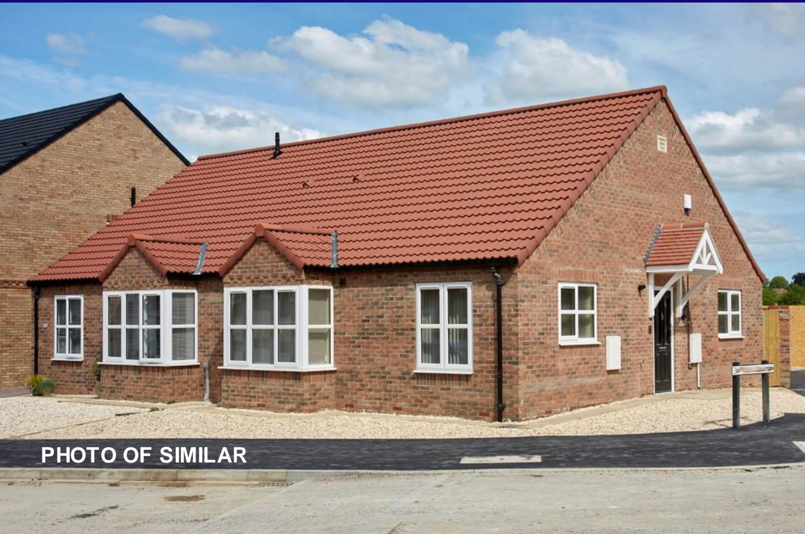
PHOTO OF SIMILAR