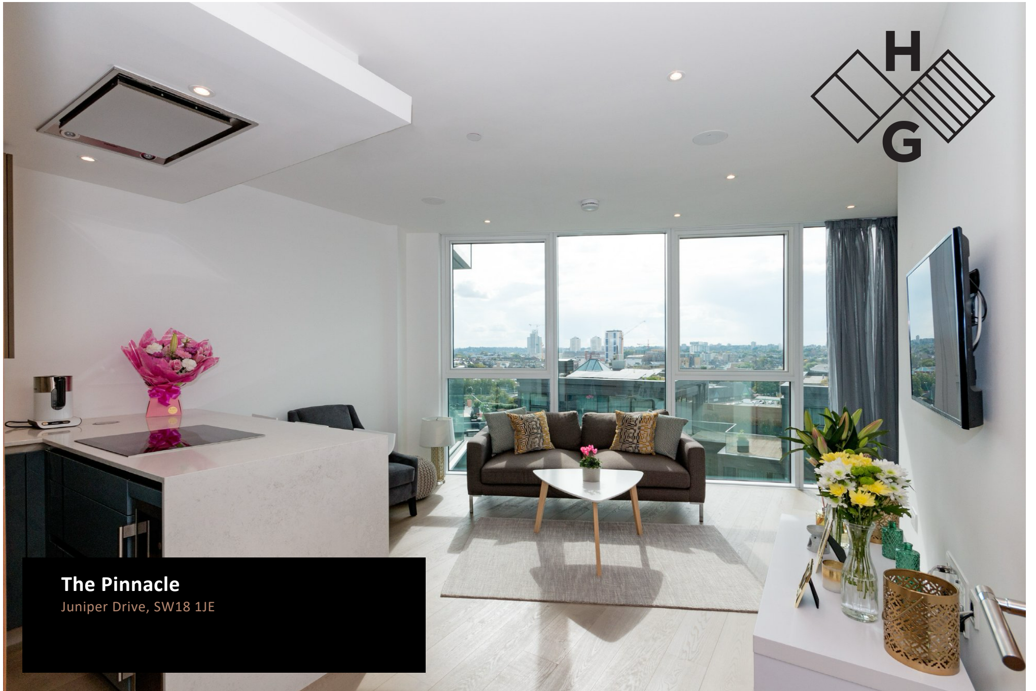
The Pinnacle Juniper Drive, SW18 1JE