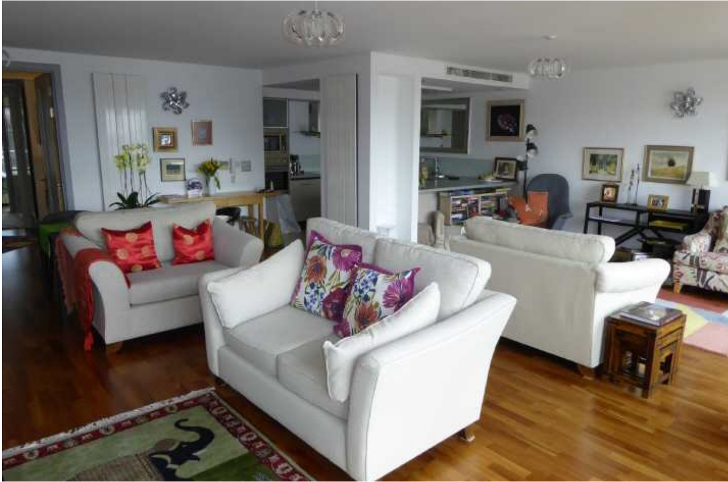
6 Leftbank, Manchester M3 3AE Price £575,000