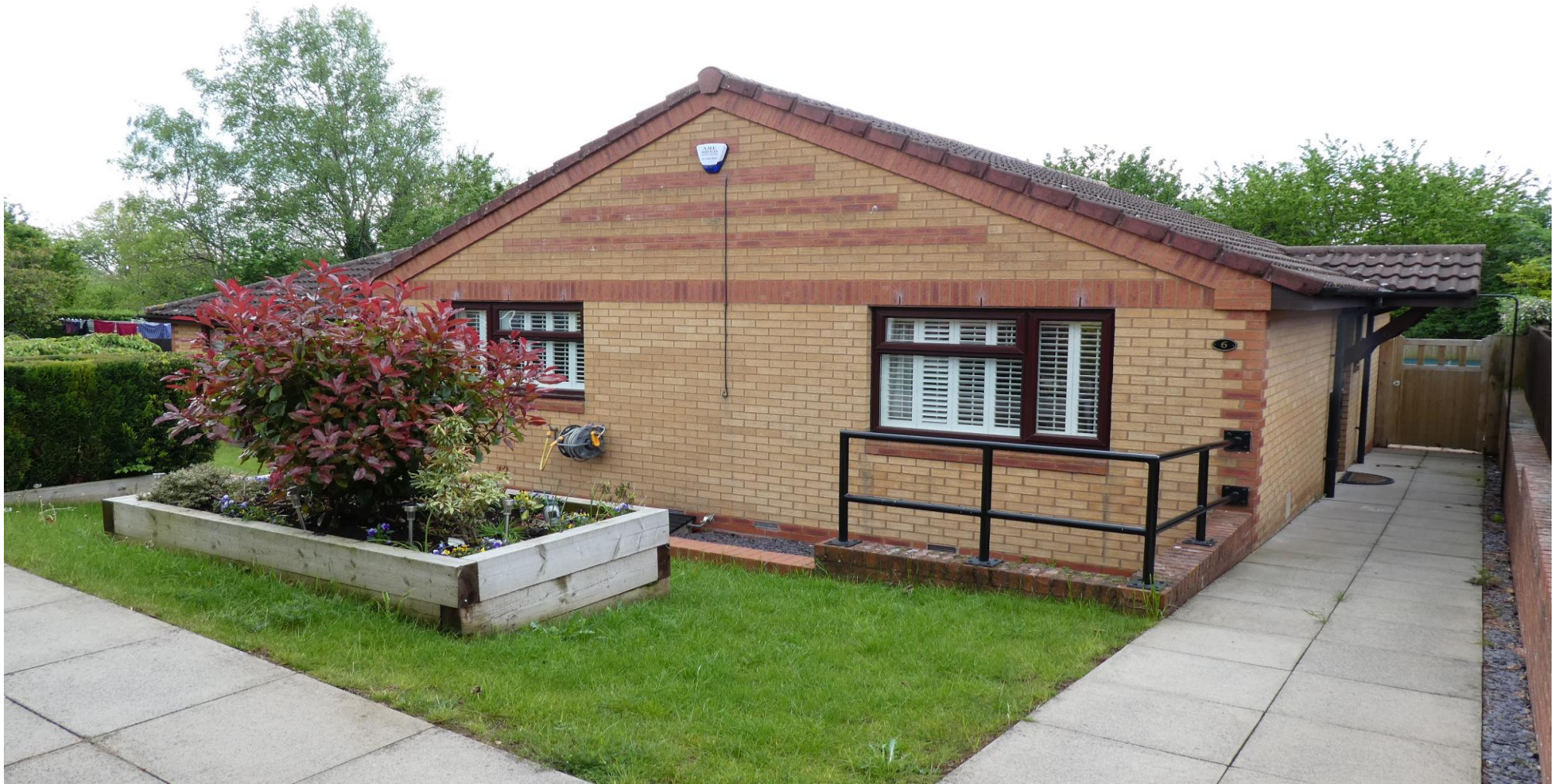
Wootton Brook Close East Hunsbury, Northampton