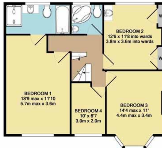
1ST FLOOR APPROX. FLOOR AREA 744 SQ. FT. (69.1 SQ. M.)