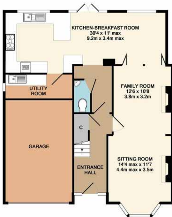
GROUND FLOOR APPROX. FLOOR AREA 1015 SQ. FT. (94.3 SQ. M.)