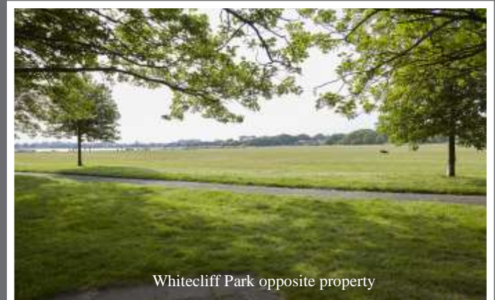
Whitecliff Park opposite property