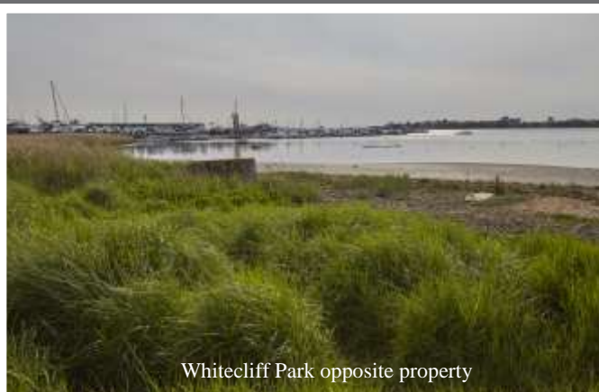
Whitecliff Park opposite property