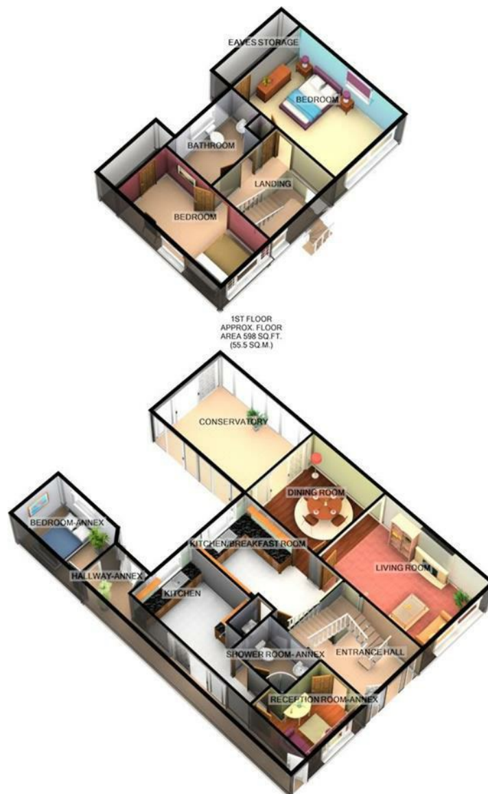
1ST FLOOR APPROX. FLOOR AREA 598 SQ.FT. (55.5 SQ.M.)