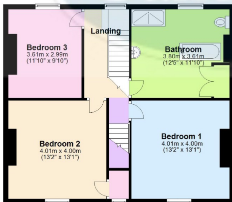
First Floor Approx. 69.4 sq. metres (747.5 sq. feet)