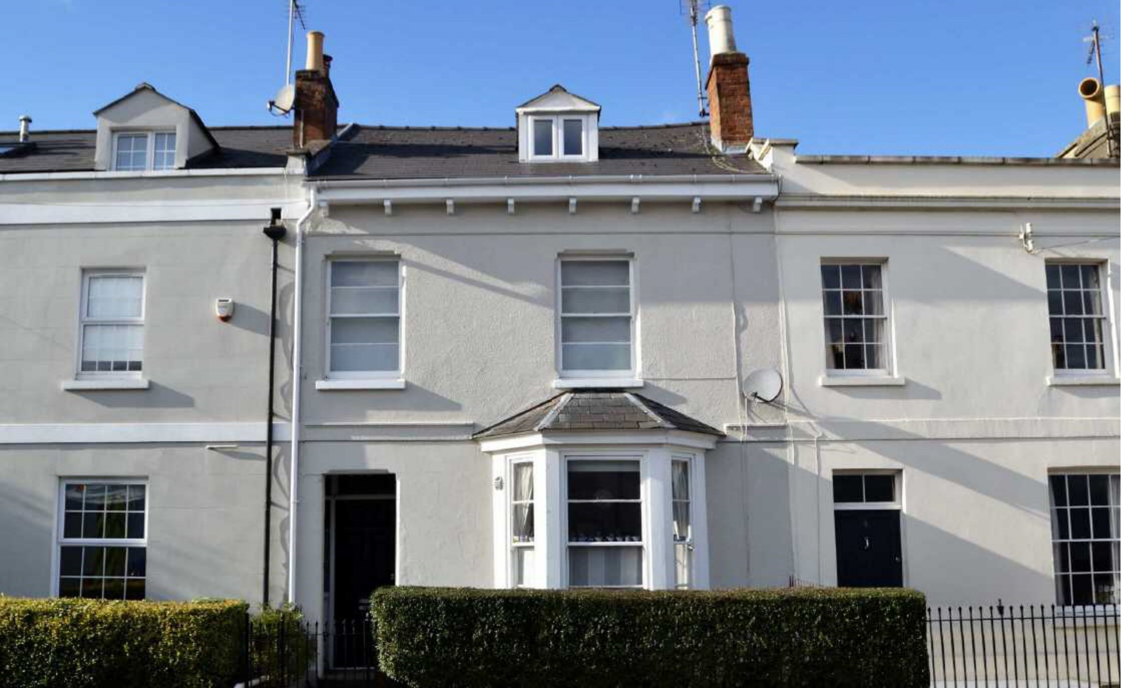
6 Windsor Street, Pittville, Cheltenham, GL52 2DE £530,000 Freehold