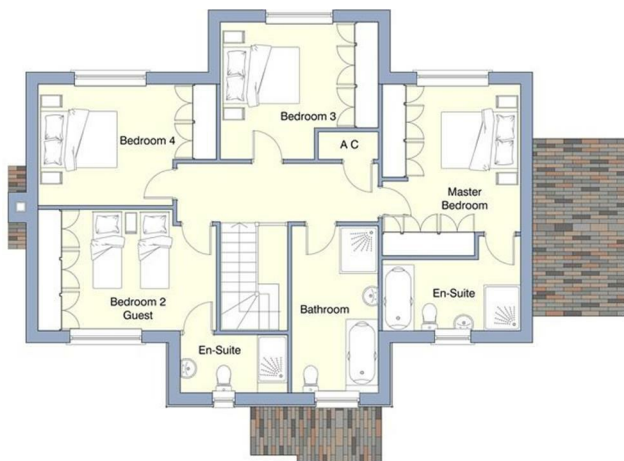
Plots 2 & 5 4 Bed Detached