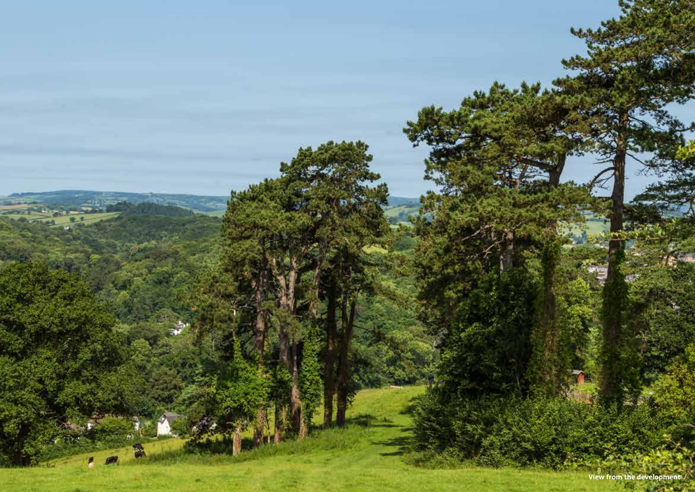
View from the development