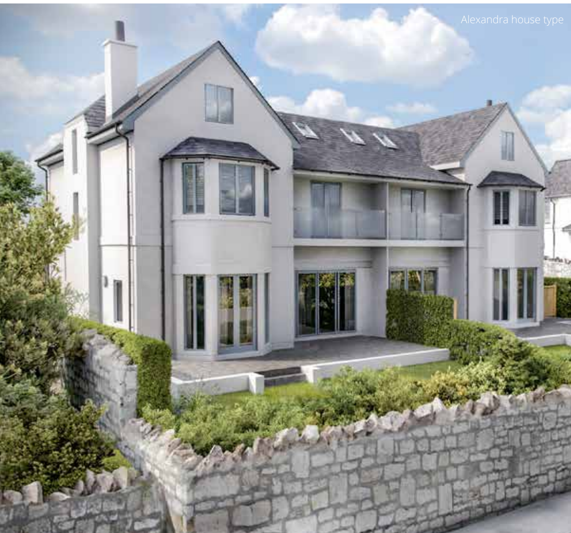
Alexandra house type

Cavanna use the finest materials selected for longevity, function and performance. Our attention to detail and quality goes beyond the build, every Cavanna Home comes with contemporary fitted kitchens and bathrooms, the latest heating systems, excellent wall and loft insulation and double glazing as standard. This means your house is thermally efficient, comfortable and beautifully stylish.