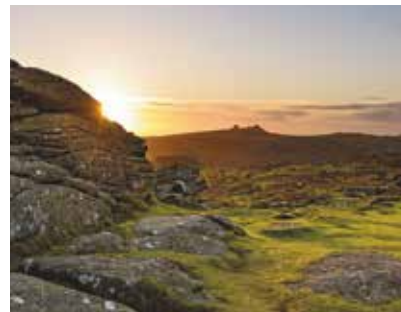
Dartmoor National Park