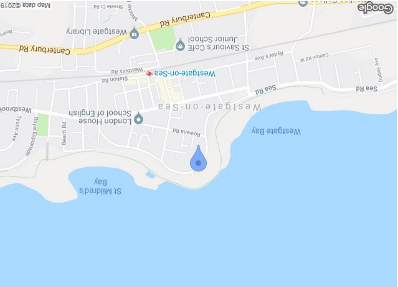
FLAT 70 PALM COURT ROWENA ROAD WESTGATE-ON-SEA