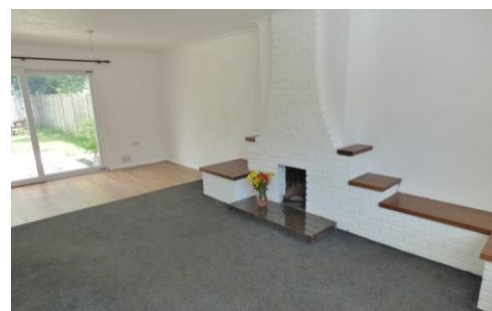
71 Friary Grange