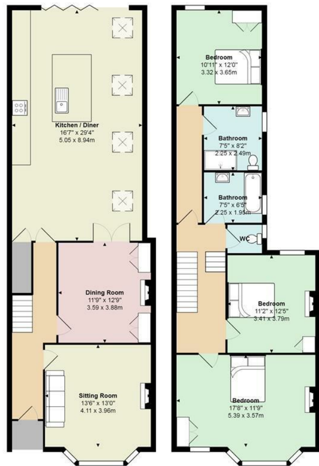
Total Area: 1748 ft² ... 162.4 m² All measurements are approximate and for display purposes only