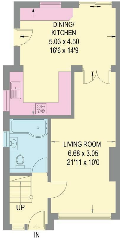
GROUND FLOOR 48.1 SQ M / 518 SQ FT