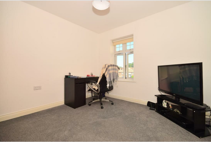
Double glazed window and central heating radiator.