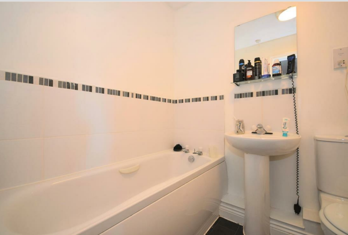
Fitted with a three piece suite comprising of low level WC, pedestal washbasin and panel bath, central heating radiator.