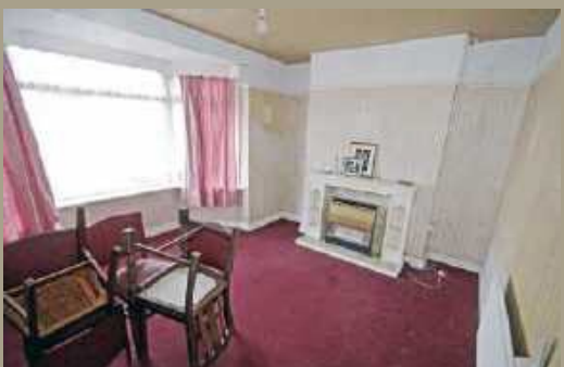
Two Reception Rooms