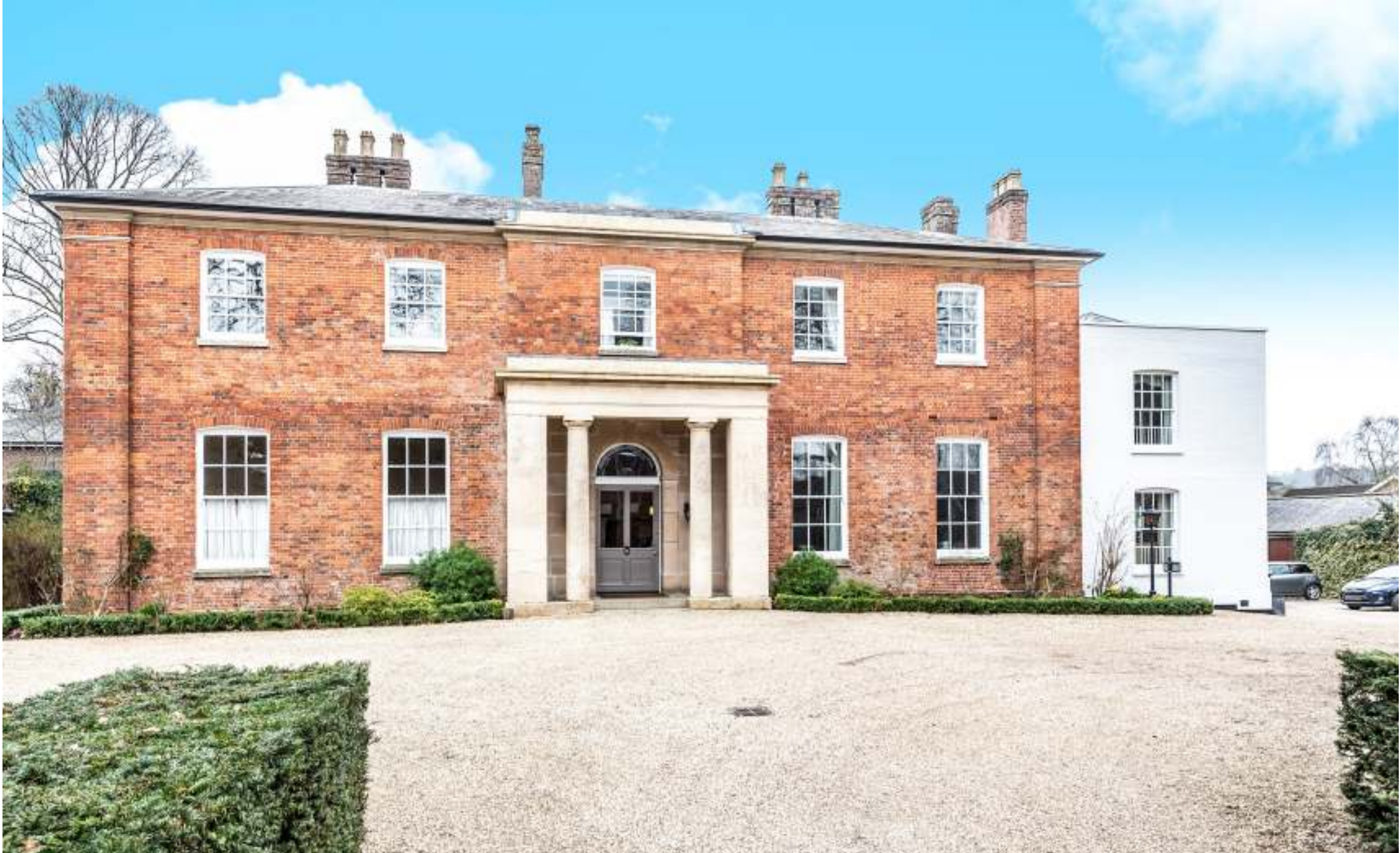
2 Wye House, Barn Street, Marlborough, Wiltshire SN8 1AB