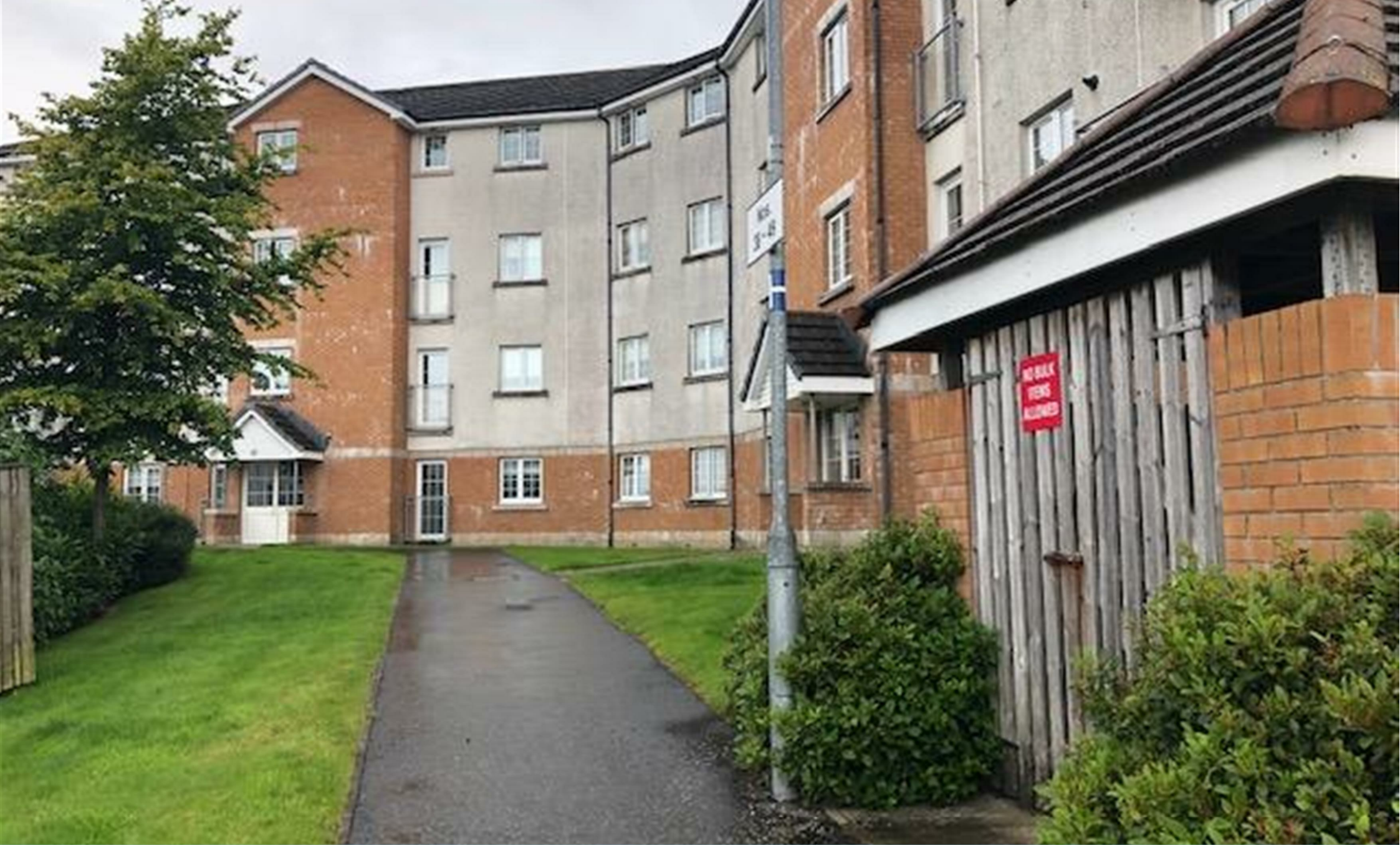
60 Stewartfield Gardens, Glasgow, Lanarkshire G74 4GN £575