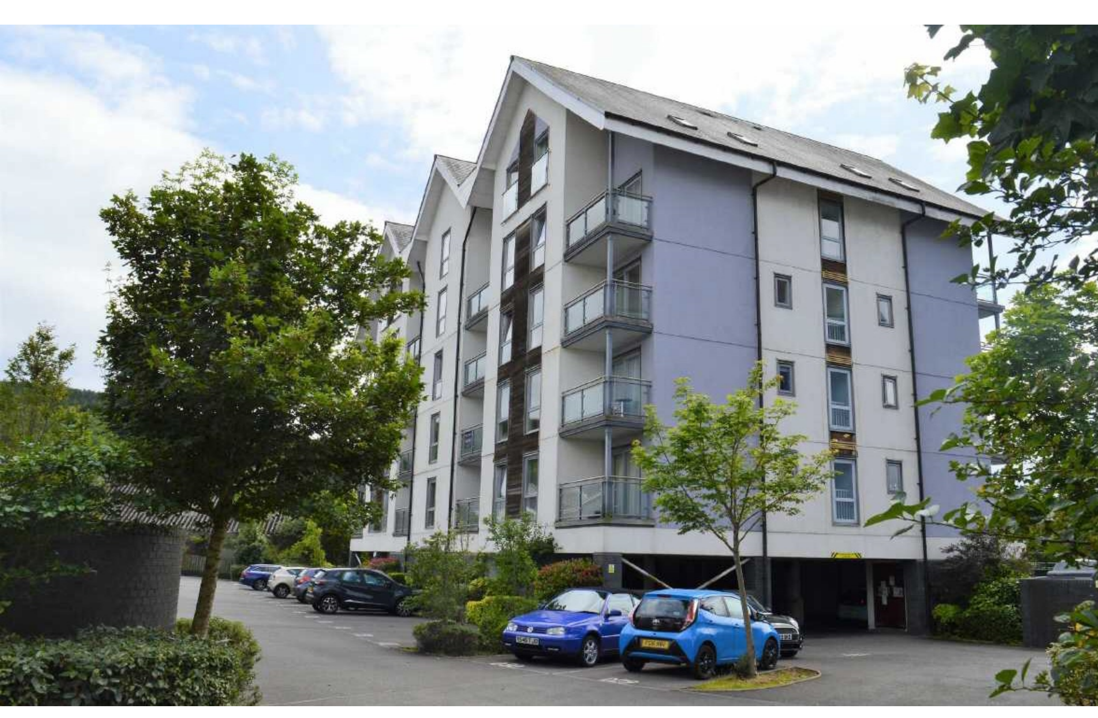
34 BELLE ISLE APARTMENTS, COPPER QUARTER, ASKING PRICE £145,000