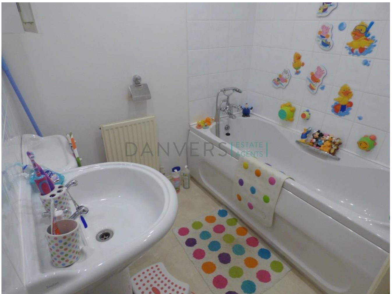
Vyner Close | Thorpe Astley | Leicester | LE3 3EJ