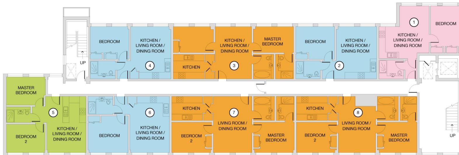
First Floor Apartments 1 - 8 Chorlton Plaza, M21

Chorlton & Didsbury Sales 430 Barlow Moor Road, Chorlton, Manchester, M21 8AD Chorlton: 0161 882 2233 Didsbury: 0161 448 0622 E: chorlton@jpbrimelow.co.uk www.jpandbrimelow.co.uk