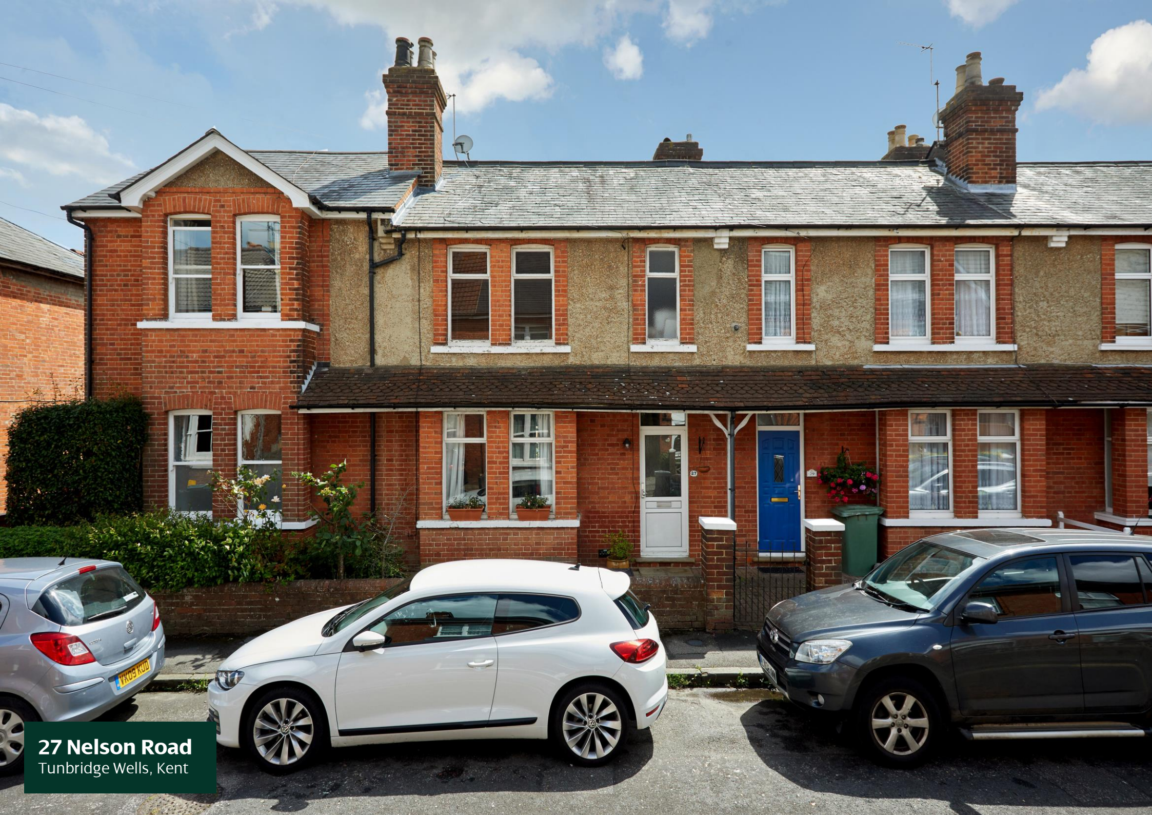
27 Nelson Road Tunbridge Wells, Kent