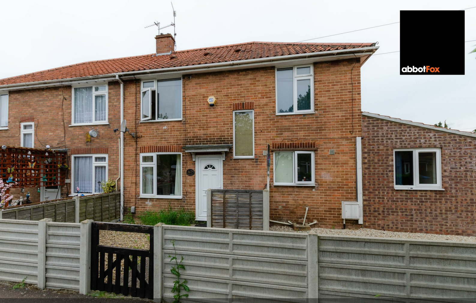
Motum Road, Norwich, NR5 Six Bedroom Semi-Detached House - Guide £265,000