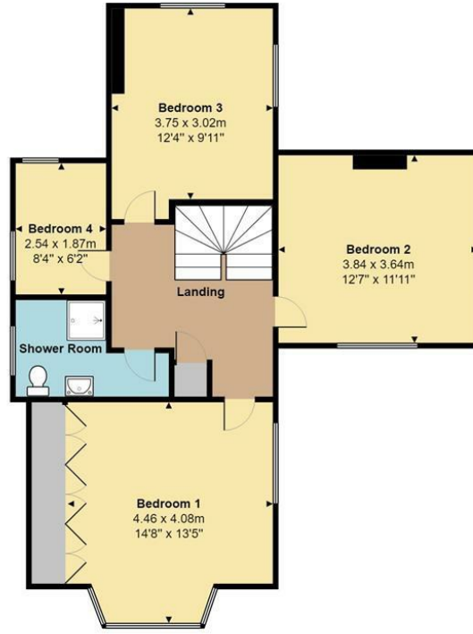
1st Floor Total Floor Area 64.7 m 2 ... 697 ft 2