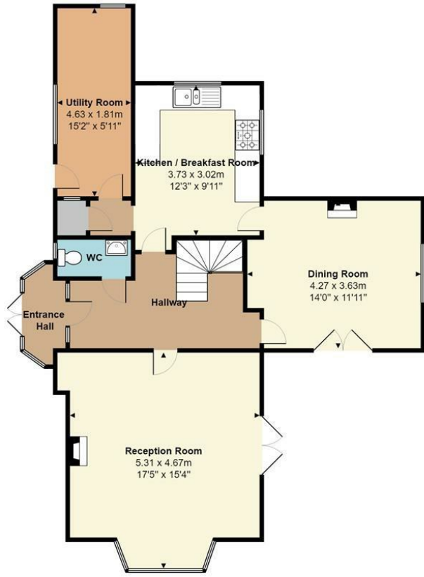
Ground Floor Total Floor Area 75.5 m 2 ... 813 ft 2