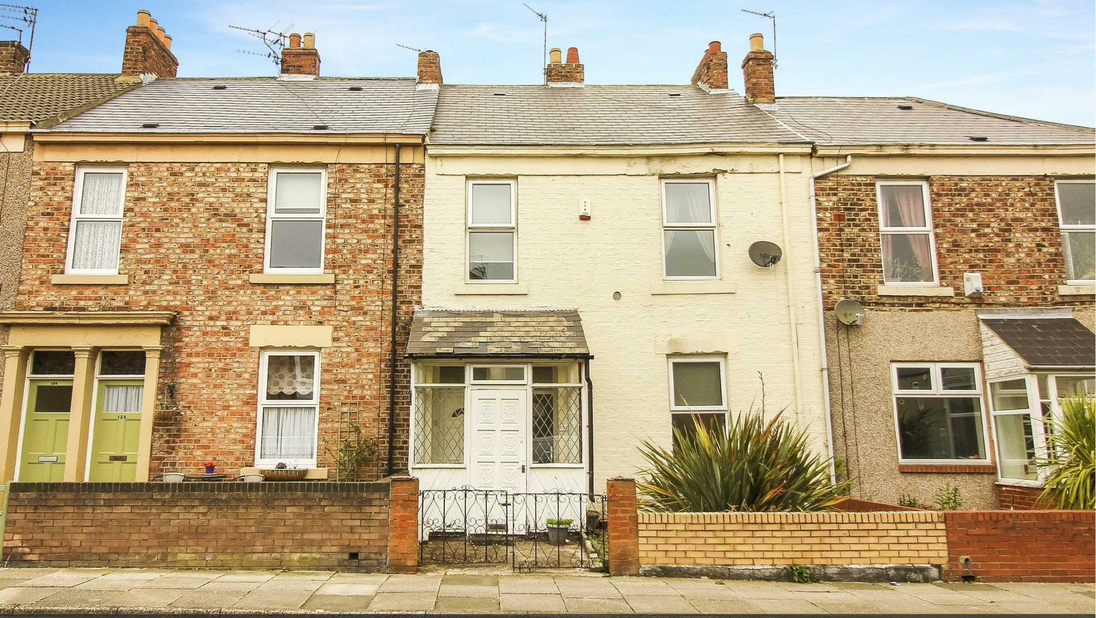
📍 Grey Street, North Shields NE30 2EQ