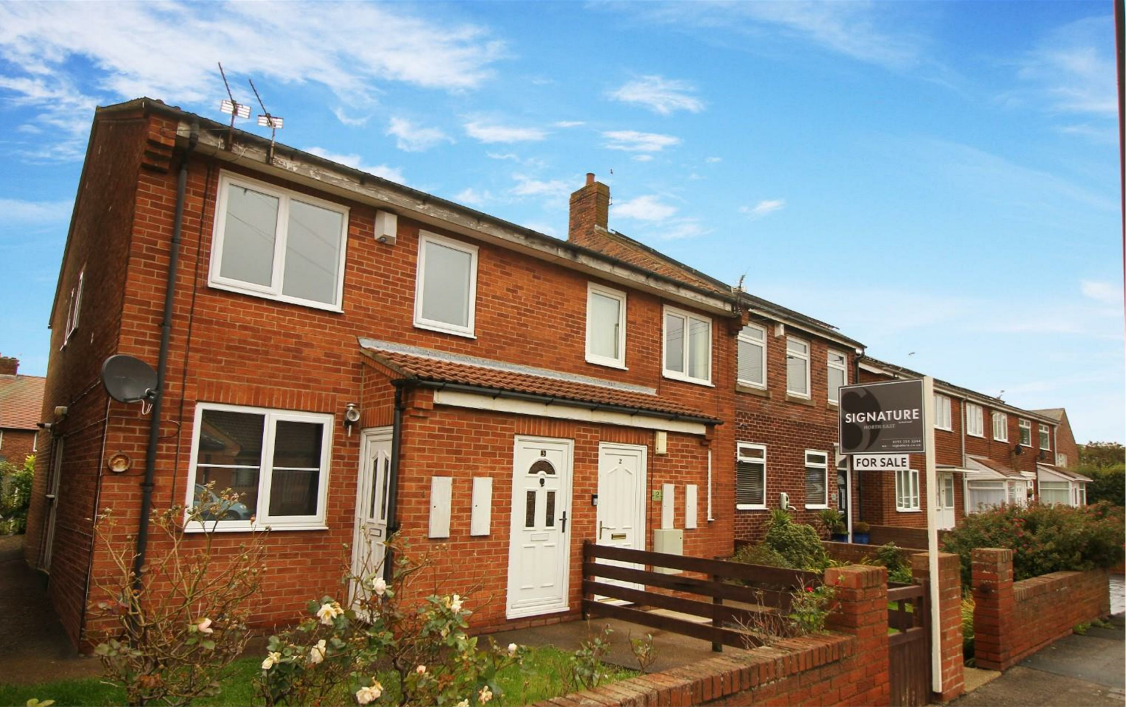
📍 Curell House, North Shields NE29 8EL