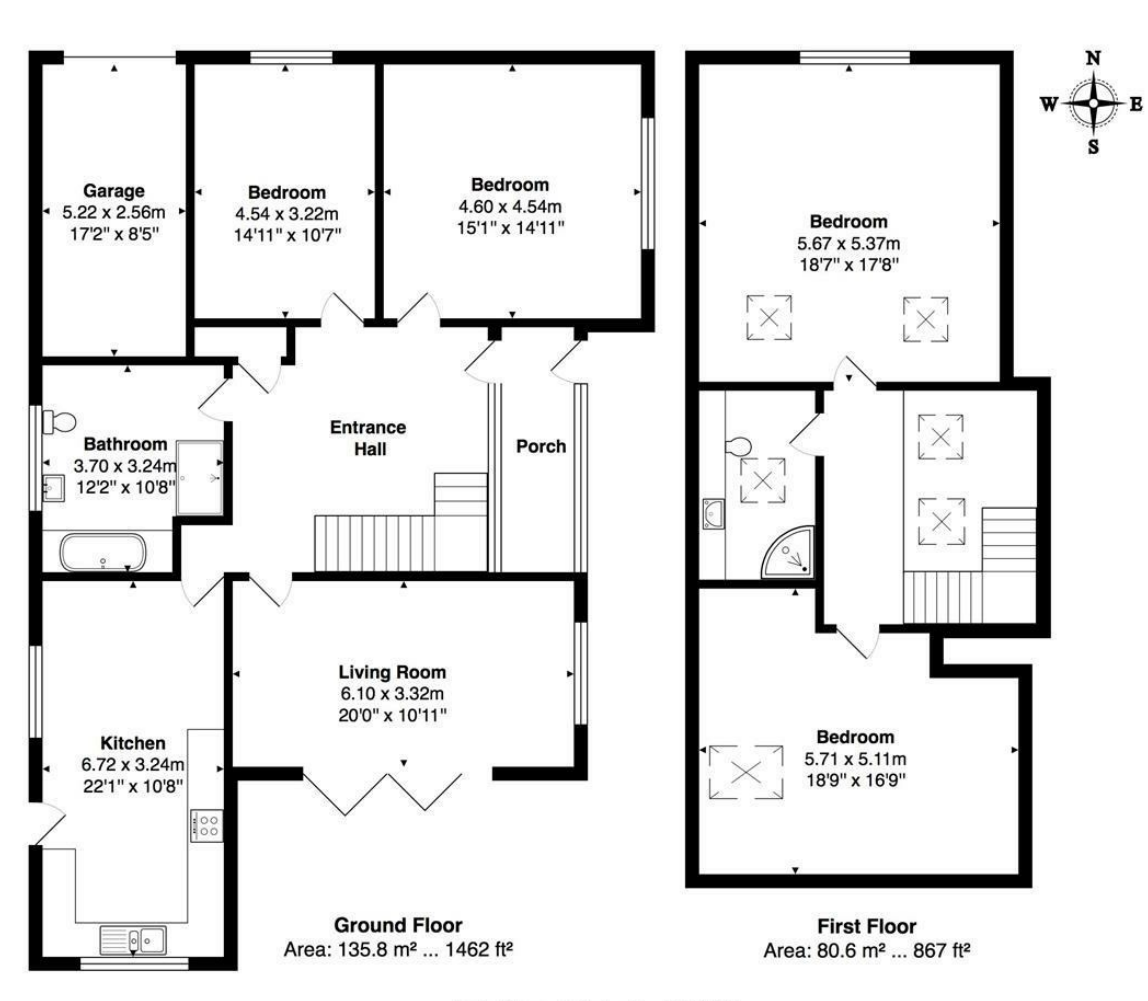
Total Area: 216.4 m<sup>2</sup> ... 2329 ft<sup>2</sup> Illustration for identification purposed only, measurements are approximate, not to scale.

Dolphin Rd A259 River Adur Harbour Way Old Fort Rd. Google Map data @2019