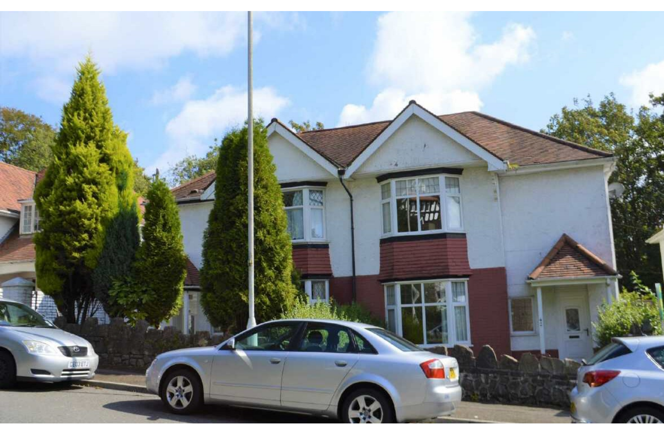
42 PARC WERN ROAD, SKETTY, SWANSEA, BEST OFFERS OVER £215,000