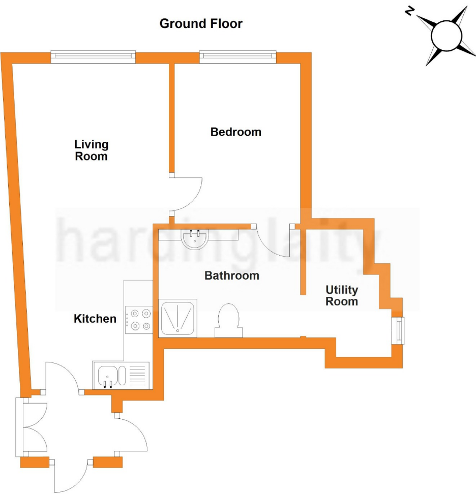
34a Fore St St Ives, St Ives