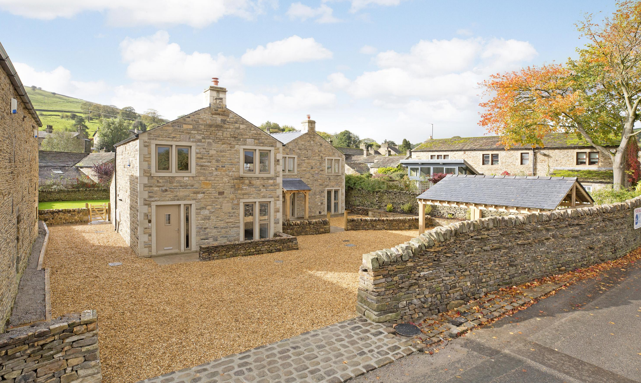
Meadow Lane, Cononley £390,000