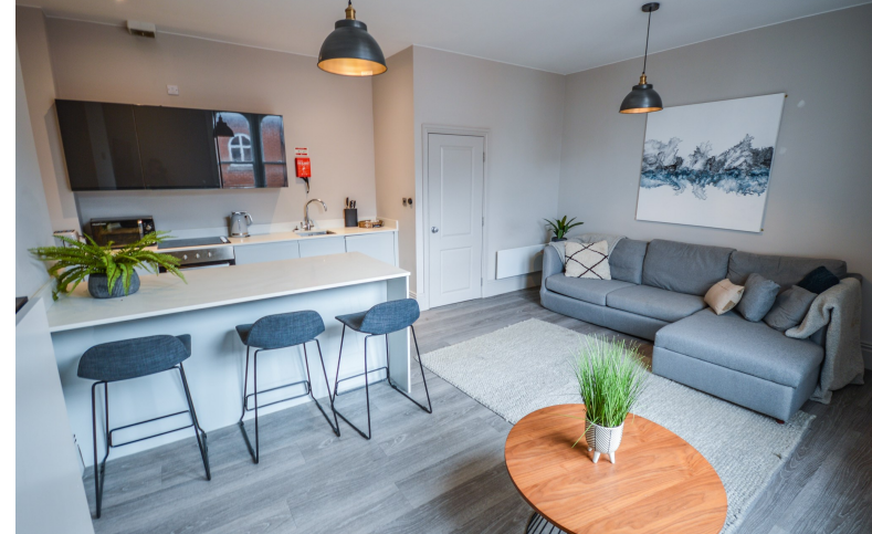
Kingsway, Altrincham WA14 Asking Price of £1,250pcm