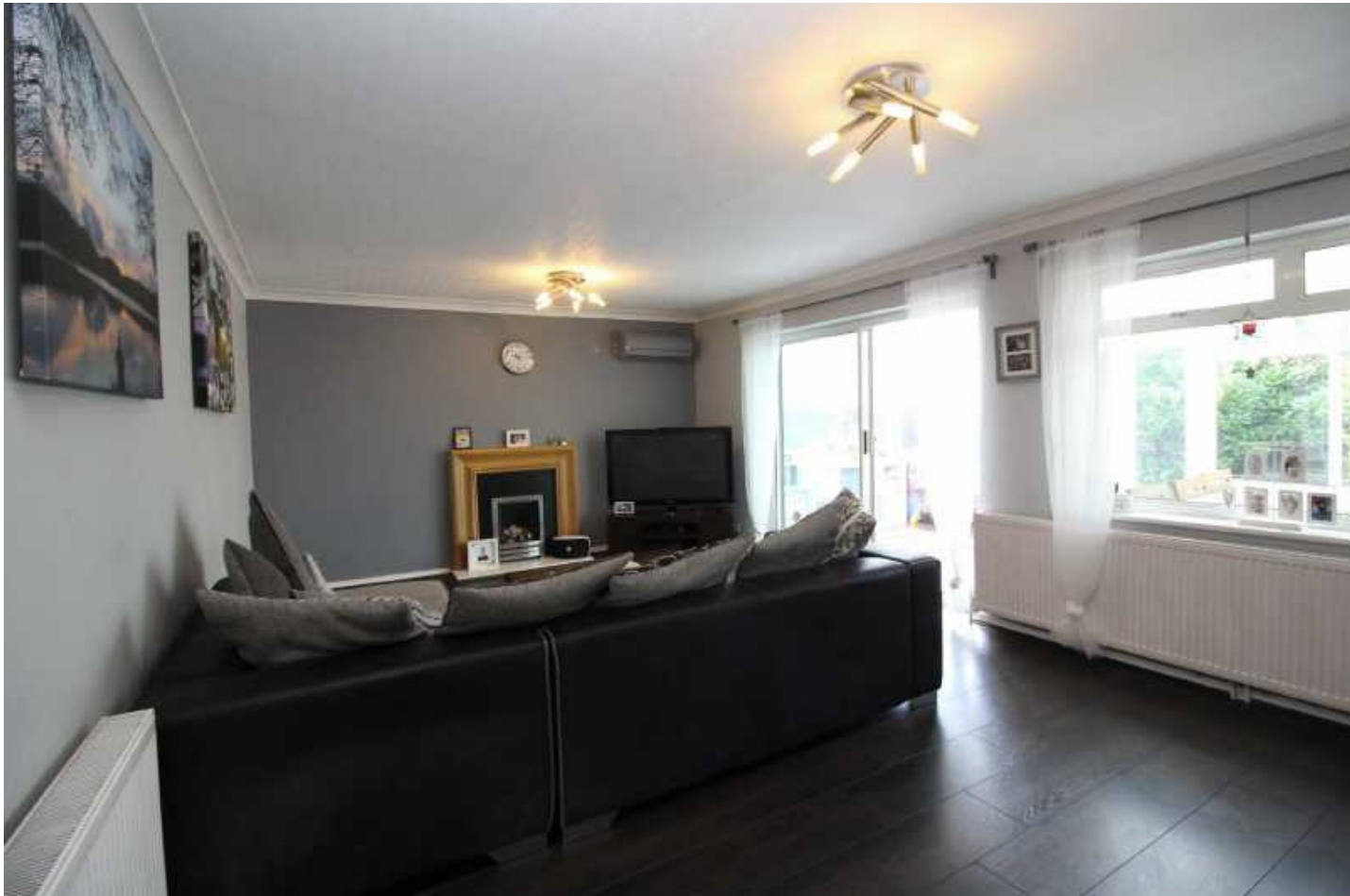
10 Bramway, High Lane, Stockport, Cheshire SK6 8EN £365,000