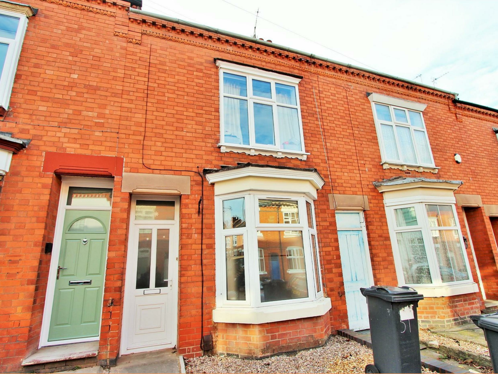
Lytton Road, Leicester, Leicestershire, LE2 1WL £1,340 PCM