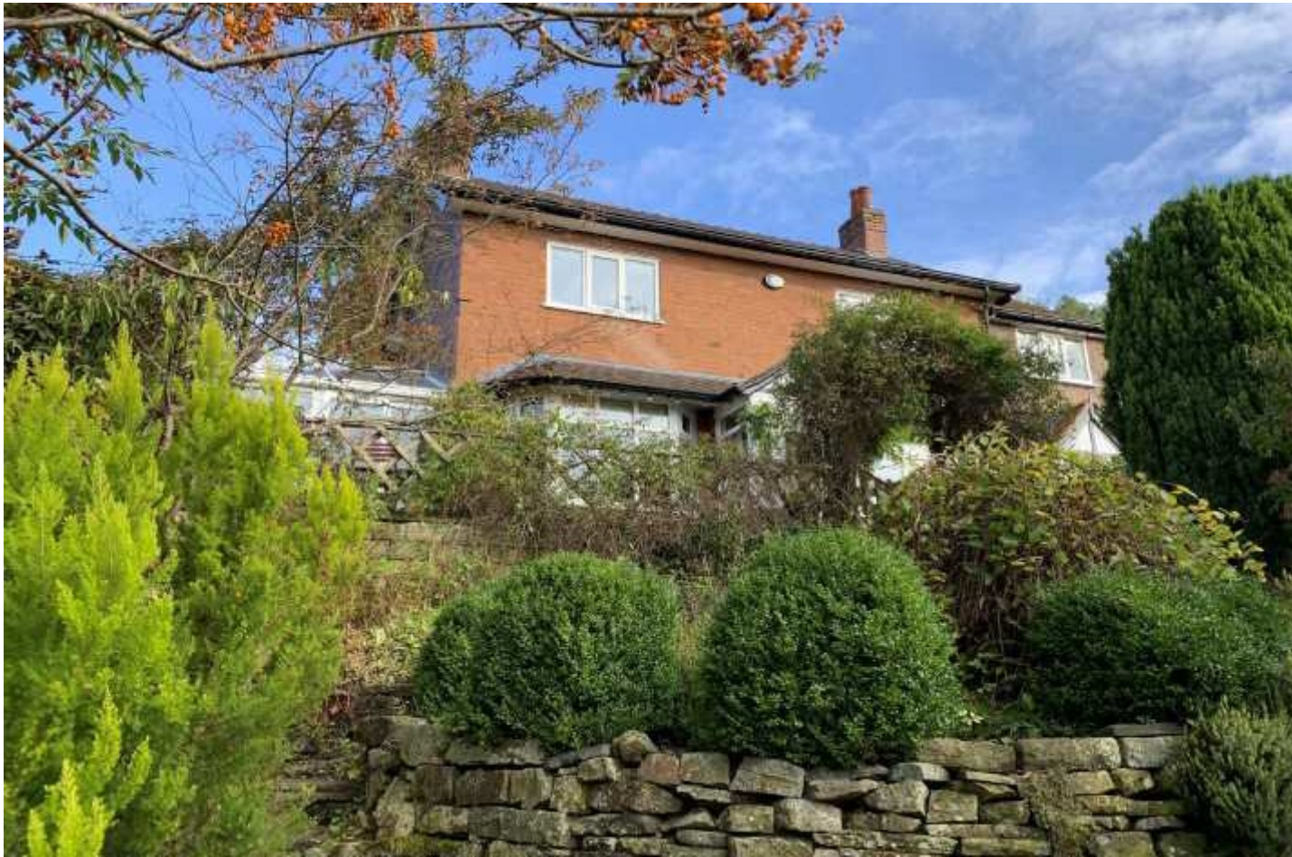
Ryversdale, Hague Bar, New Mills, High Peak, Derbyshire SK22 3AT £1,300 Per calendar month