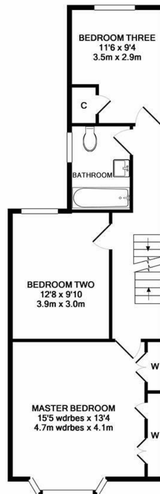
1ST FLOOR APPROX. FLOOR AREA 593 SQ.FT. (55.1 SQ.M.)

TOTAL APPROX. FLOOR AREA 1528 SQ.FT. (142.0 SQ.M.)