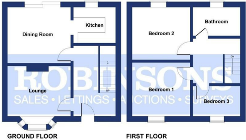
SKETCH PLAN FOR ILLUSTRATIVE PURPOSES ONLY

All measurements walls, doors, windows, fittings and appliances, their sizes and locations, are approximate only. They cannot be regarded as being a representation by the seller, nor their agent.