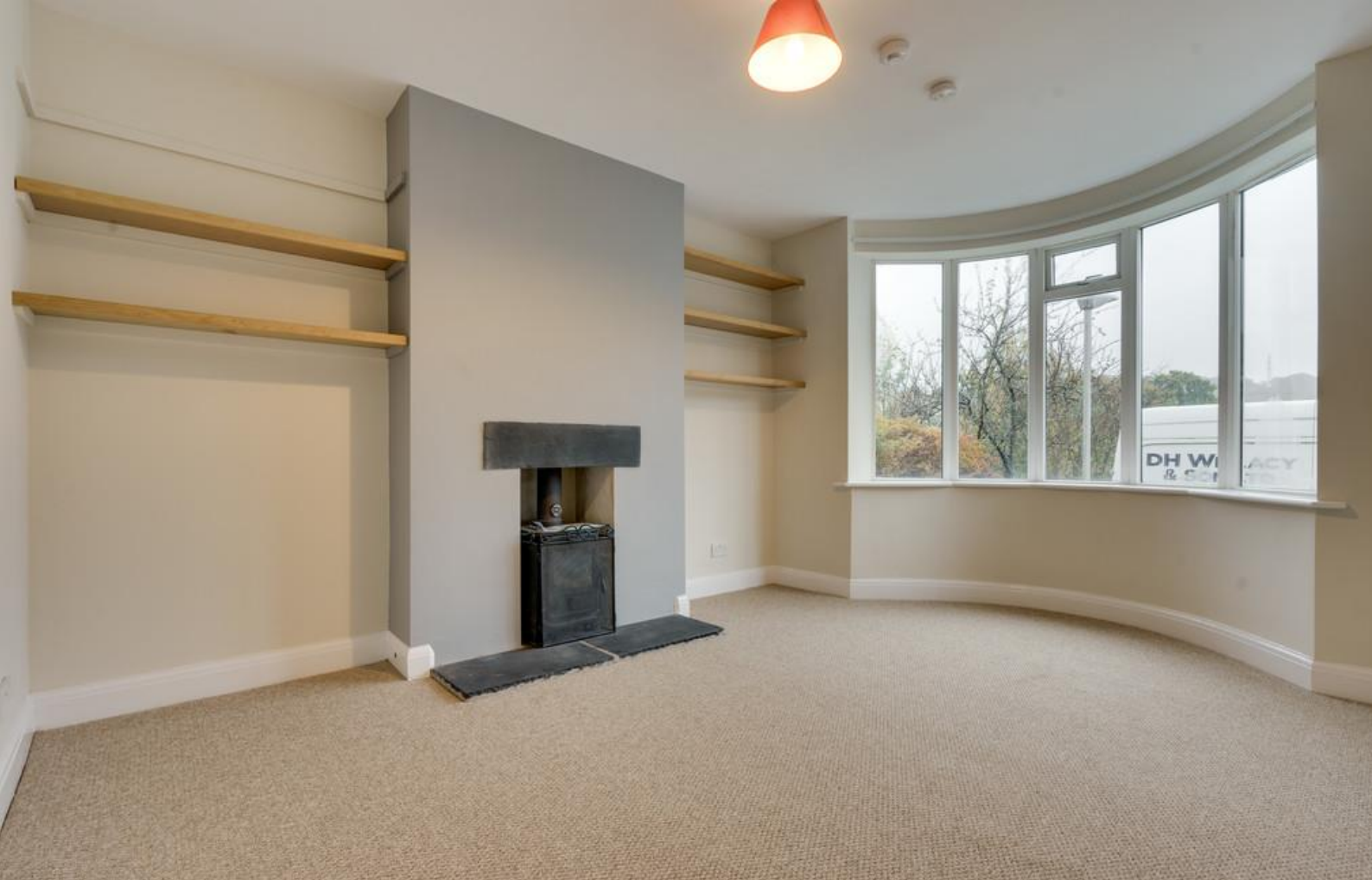
Lounge with wood burner

Location: Leaving Kendal along the A684 Sedburgh Road pass the entrance for Sandylands Road and take the next left turn in to Dalton Road to find number 5 located on the left forming part of the last set of semi-detached houses.