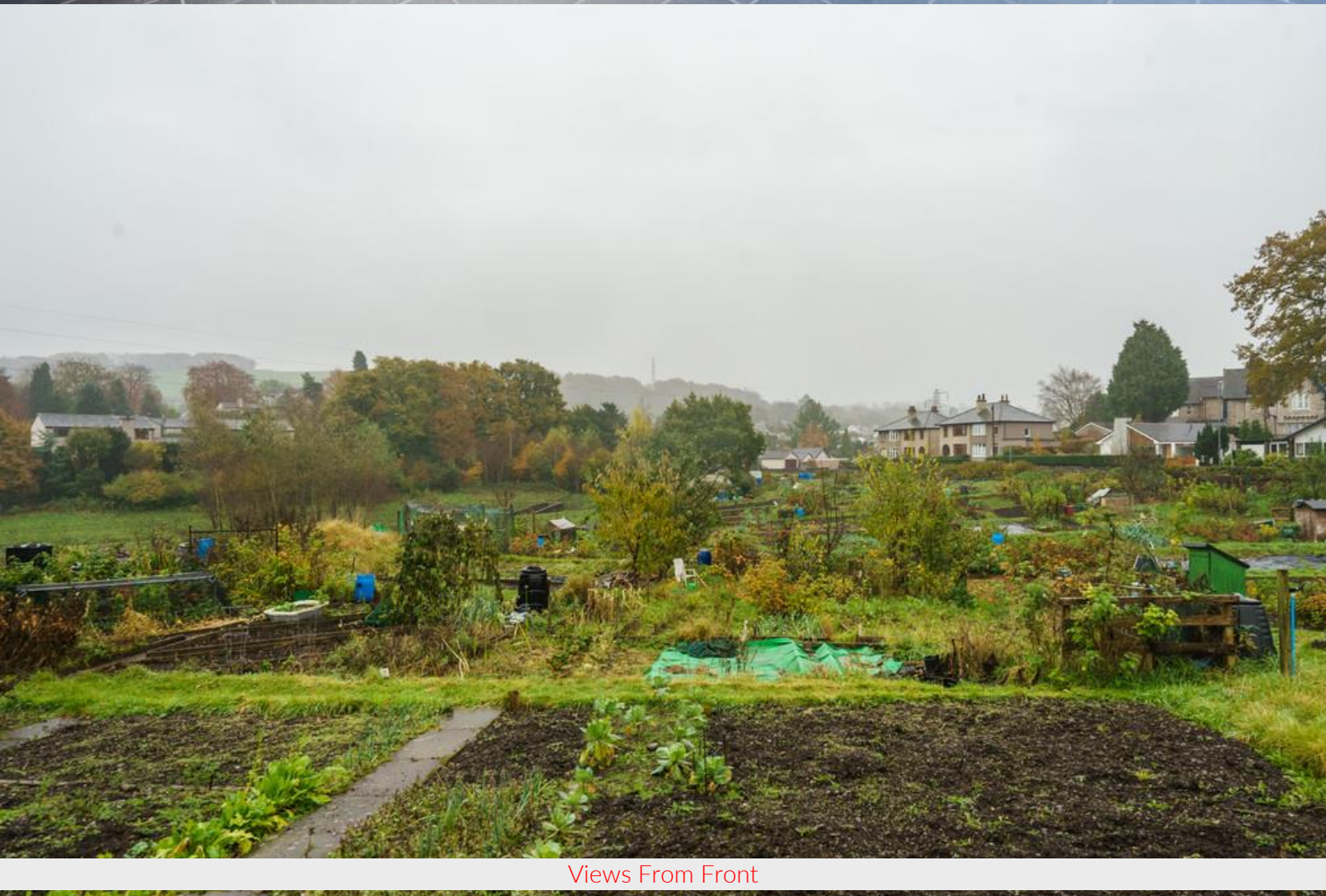
Views From Front