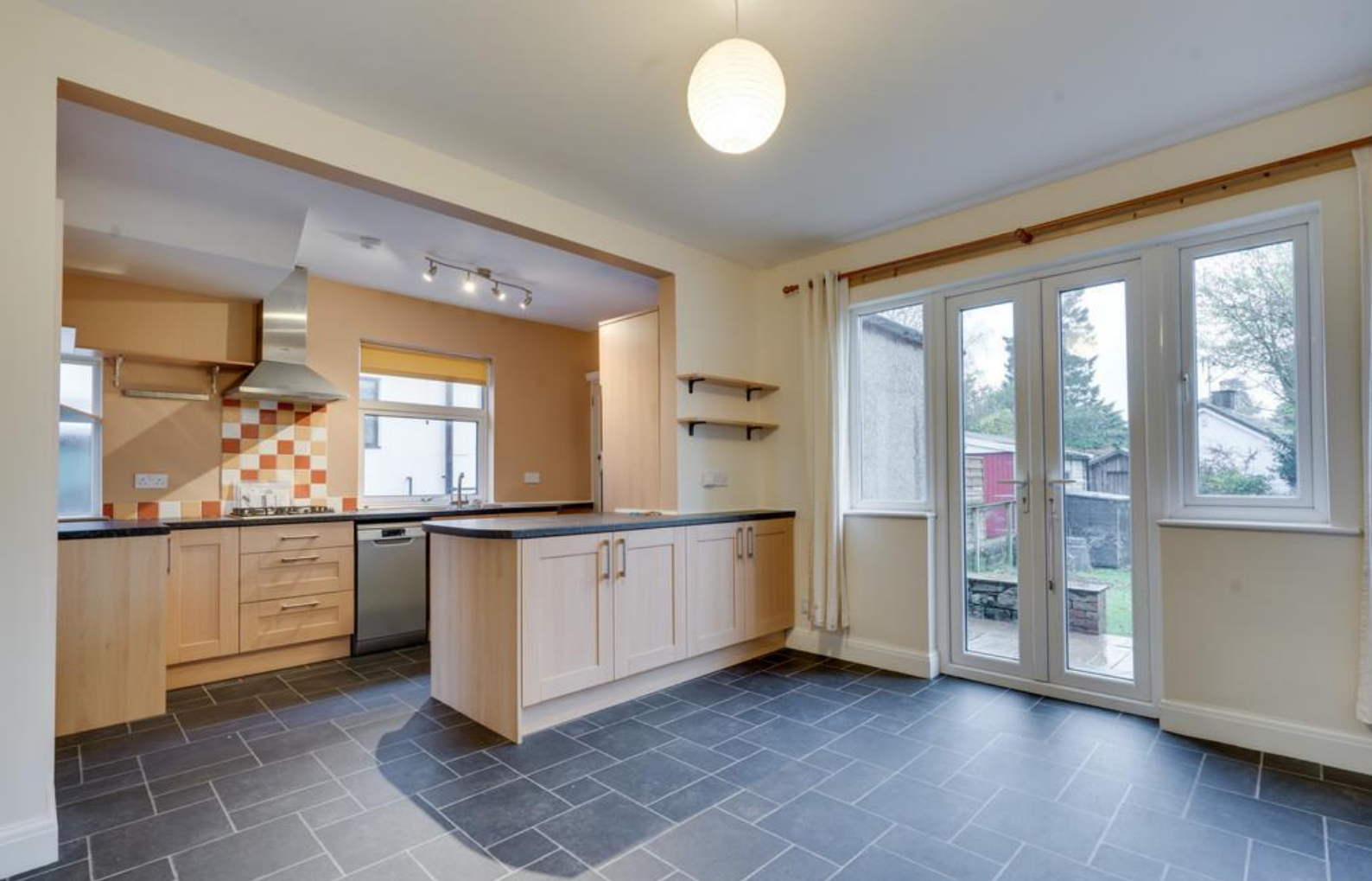
Kitchen Dining Room