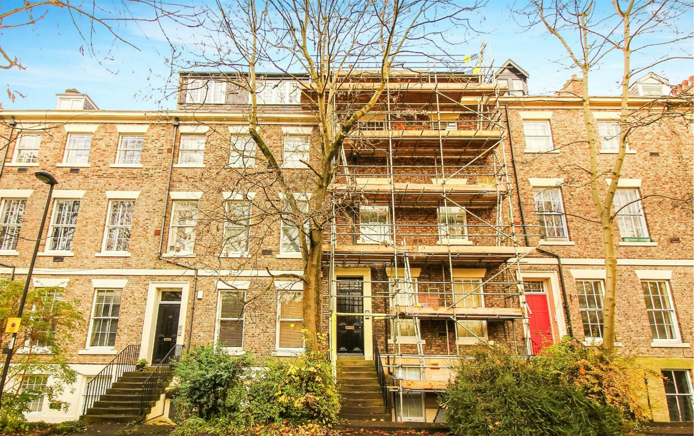
📍 Victoria Square, Newcastle Upon Tyne NE2 4DE