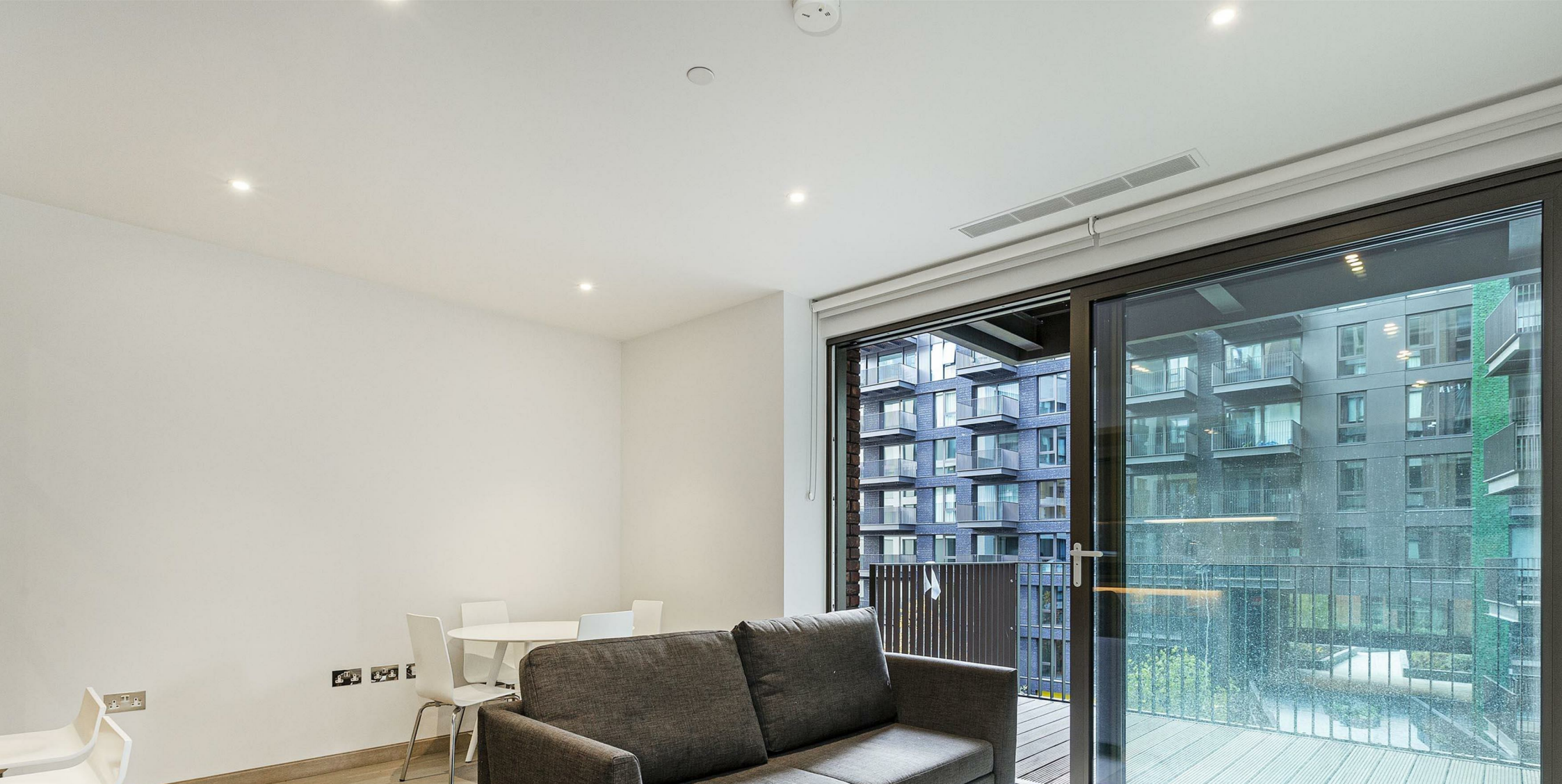
Legacy Building, Nine Elms London SW11