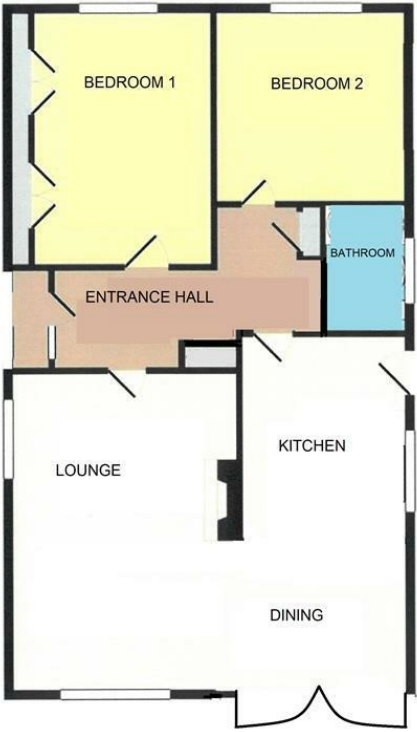
Floor Plan (for identification purposes only)

72 Westlands Way, Leven HU17 5LQ £225,000