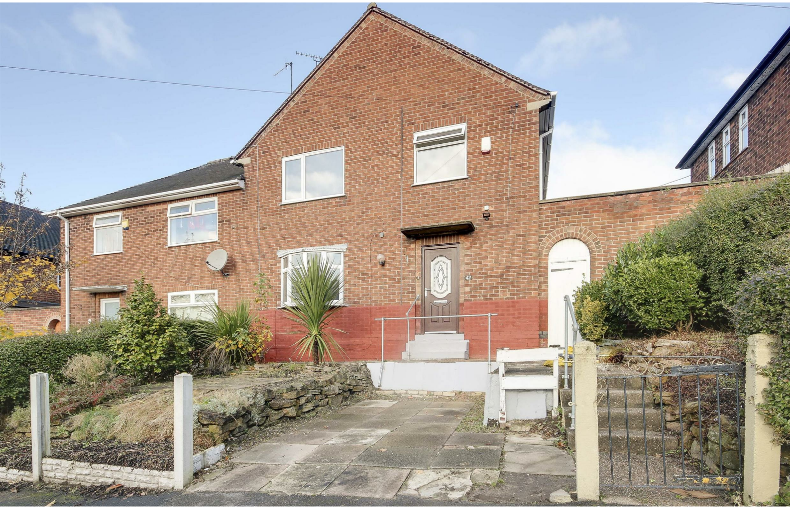
Torbay Crescent, Bestwood, Nottinghamshire NG5 5HG