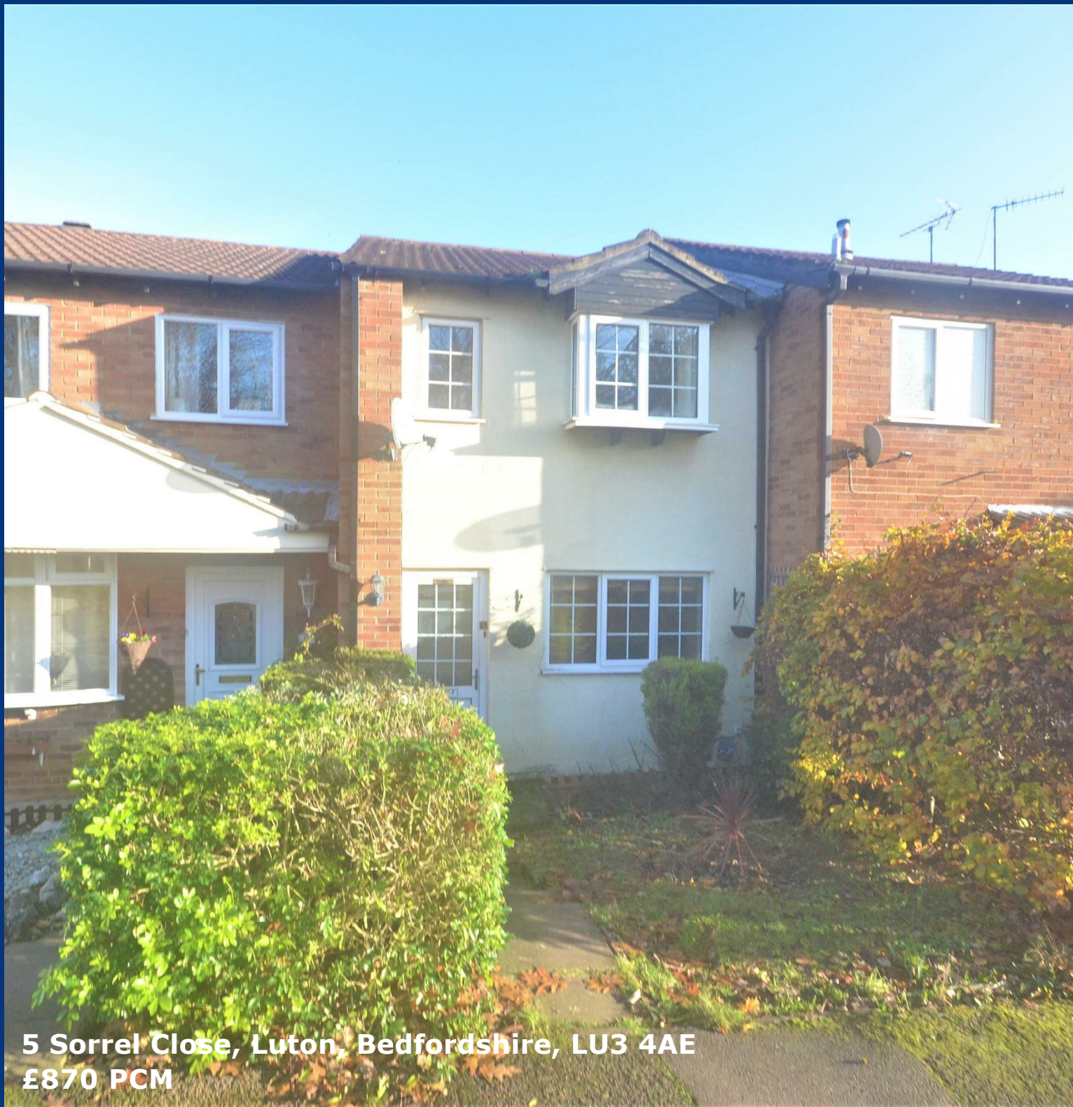
5 Sorrel Close, Luton, Bedfordshire, LU3 4AE £870 PCM