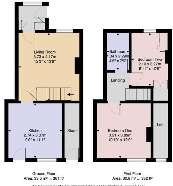
All measurements are approximate and for display purposes only. No liability is accept by either the agency or Box Property Solutions Ltd as to the exact measurements of the rooms. Box Property Solutions Ltd retains the copyright on these plans and allows agents to use with with agreed permission.