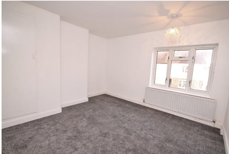
BEDROOM TWO 14' 6" x 7' 10" (4.439m x 2.4m) Another double bedroom with a central heated radiator and double glazed window to the rear aspect.