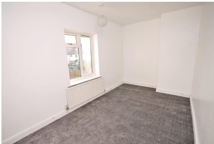
BEDROOM THREE 7' 11" x 8' 6" (2.415m x 2.601m) Having a central heated radiator and double glazed window to the front aspect.