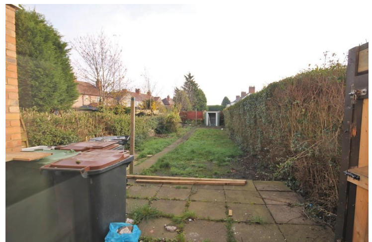
GARDEN A good-sized, private rear garden with a paved area followed by a lawn with a paved path leading to the rear.