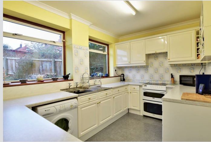
Kitchen 12'3" x 10'9"

Maximum width, a good selection of base and eye level units with stone coloured working surfaces incorporating a single drainer stainless steel sink unit, space for gas cooker, plumbing for washer, space for under bench fridge and freezer, glass fronted display cabinets, tiled splashbacks, vinyl floor tiles, double glazed windows to rear.