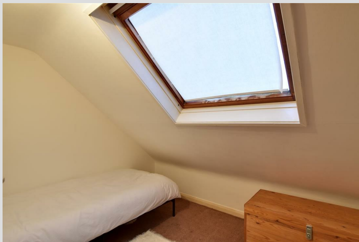
Bedroom 5 8'3" x 10'1"

Velux window, airing cupboard with fitted shelving.