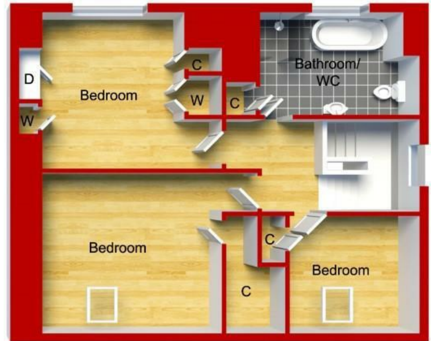
Room In Roof Approximate Floor Area (59.87 sq.m)