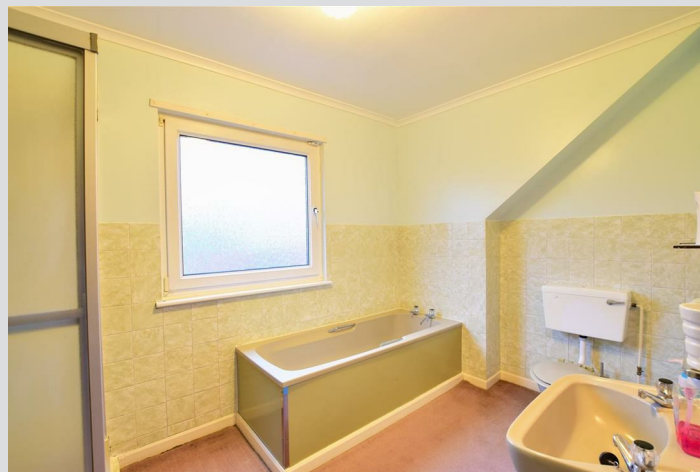
Bathroom 7'2" x 11'3"

Low level WC, pedestal washbasin, panel bath, corner shower cubicle - large coloured suite with part tiled walls, fitted mirror, light over, electric shaver point, double radiator, UPVC double glazed window and built in cupboard.