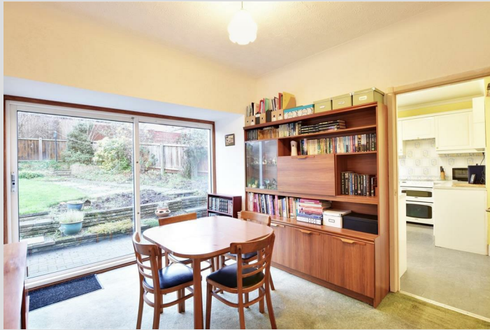
Dining Room 10'0" x 11'4"

Double glazed sliding patio doors leading out into rear gardens, double radiator, coved cornice to ceiling, interconnecting door to