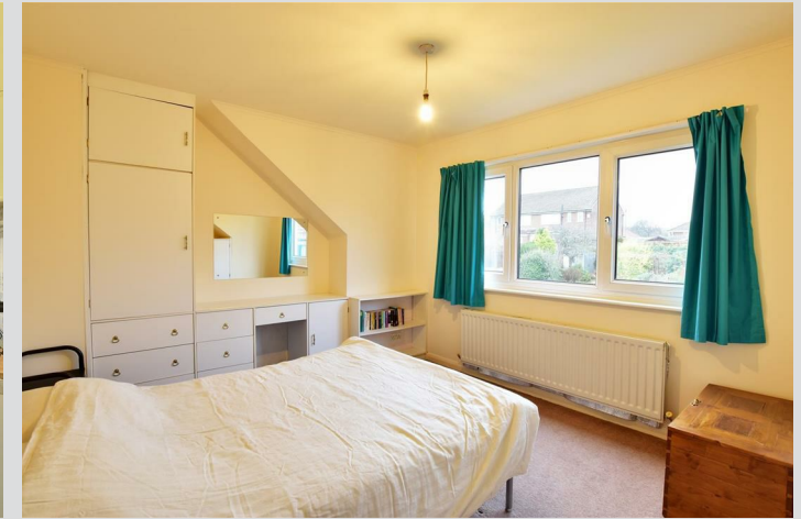
Bedroom 3 (rear) 11'0" x 14'3"

UPVC double glazed windows to rear overlooking gardens, double radiator, fitted wardrobes, drawers and dressing table.