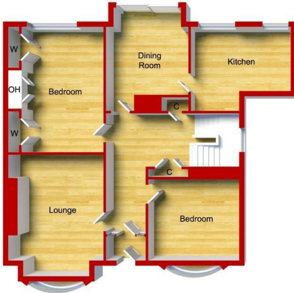
Ground Floor Approximate Floor Area (87.05 sq.m)