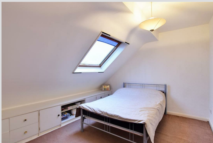
Bedroom 4 11'3" x 13'10"

Maximum dimensions, velux window, fitted drawers and cupboards, built in cupboard with ample storage space into eaves, double radiator.