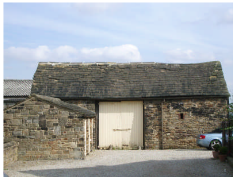
Unit 4 - Rear View

Units 5 & 6 New build individually designed detached houses providing approximately 174sq m (1,872sq ft) of floor area.