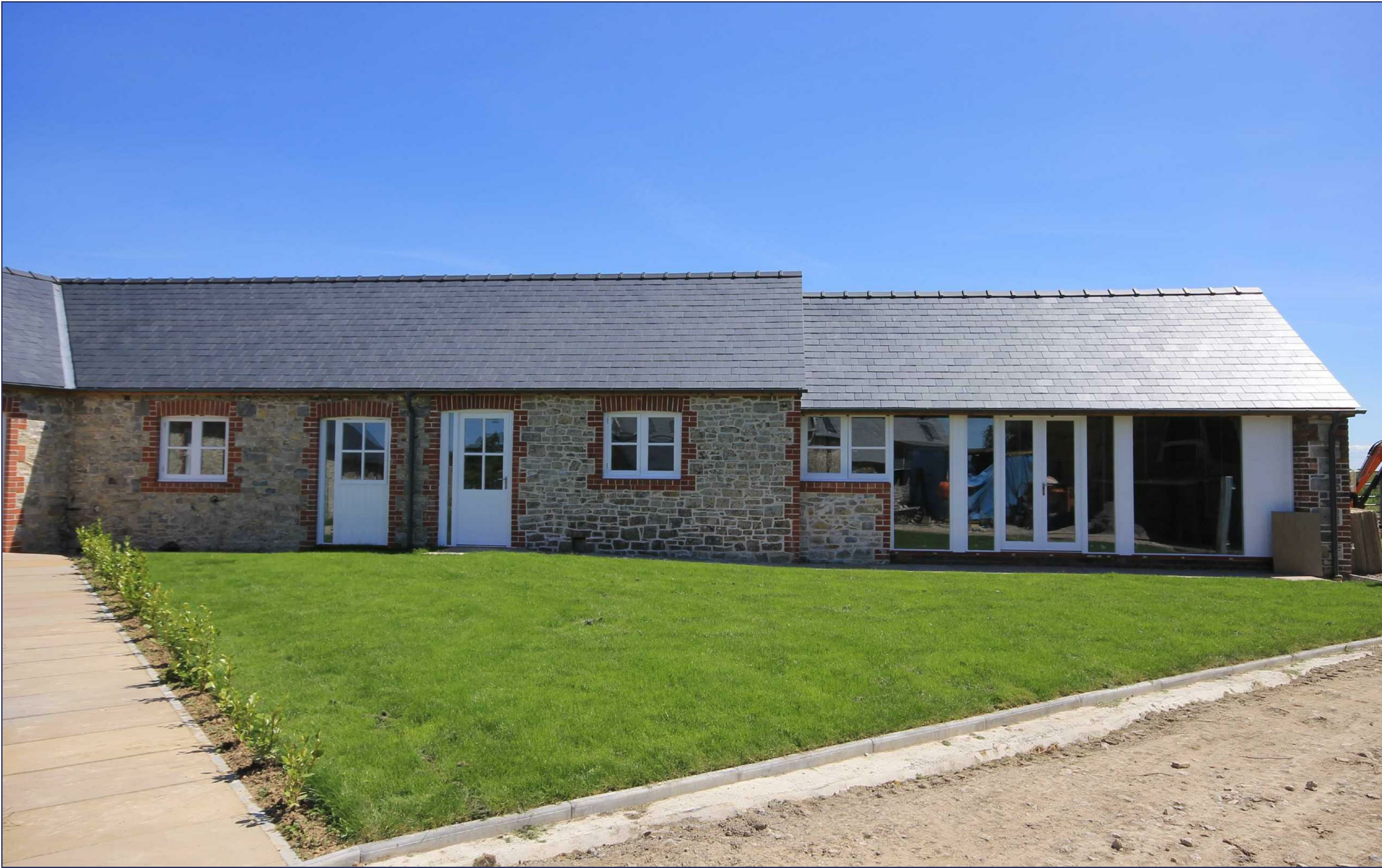
Ty Cae, Great Frampton House, , Frampton CF61 2YR Asking Price £365,000